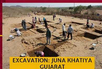
EXCAVATION: JUNA KHATIYA GUJARAT