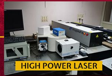
HIGH POWER LASER