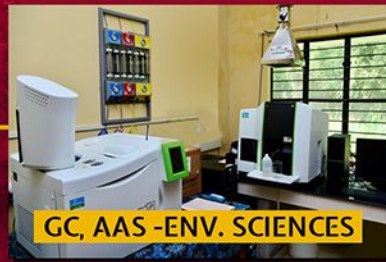
GC, AAS - ENV. SCIENCES